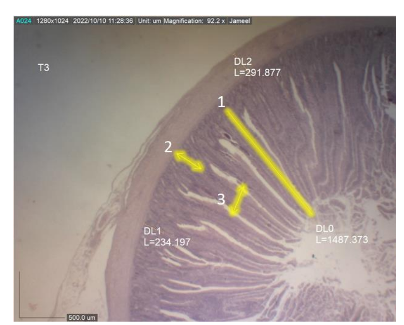
Figure 2. Villus morphometric measurements: 1-villus height; 2- crypt depth; 3- villus width.

final phase of the trial encompassed an evaluation of jejunal histomorphology. Using Dinocapture 2.0 software version 1.4.0.B, the histological sections were examined employing a low-power microscope (10x) to measure various parameters, including villus height, villus width, crypt width, and the ratio of villus height to crypt depth. Further, the mean absorptive surface area (ASA) was also calculated with the help of the following formula by Kisielinski et al. , (2002): ASA (mm)<sup>2</sup> = [ (villus width × villus length) + (villus width/2 + crypt width/2)<sup>2</sup> - (villus width/2)<sup>2</sup>] / [(villus width/2 + crypt width)/2)<sup>2</sup>]